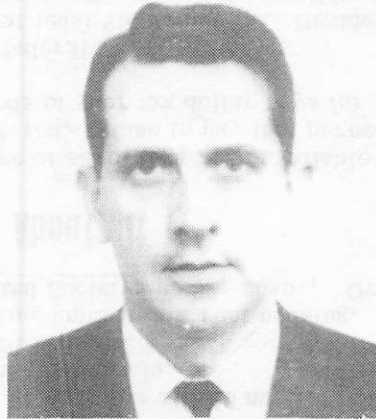
Photograph taken 1966