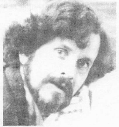
Photograph taken 1971